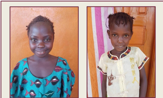
Two of the displaced children your donations helped resettle in new homes in Central African Republic.

and discipleship classes, Vacation Bible School in the summer, trauma healing training, personal finance, and infant nutrition.